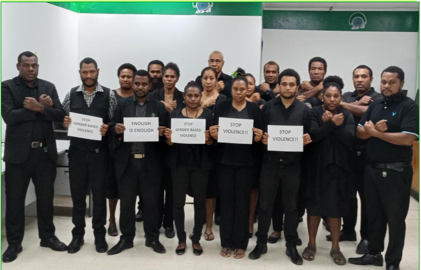
NCSL Head Office team standing together to show support for the campaign to end gender based violence.

NCSL SUPPORTS the campaign to end gender-based violence. Staff at the Port Moresby Head Office turned up to work in black as a show of support to end violence of any form, especially against women and also remembering all the men and children around the country and world who lost their lives as a result of violence.