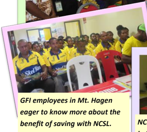
GFI employees in Mt. Hagen eager to know more about the benefit of saving with NCSL.