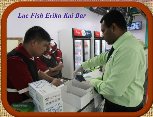
Lae Fish Eriku Kai Bar