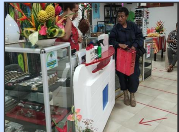
Mt. Hagen; Styles Smiles staff with the NCSL VBLP signage visible for members to see when in the shop

Contact Marketing to obtain your membership card, on 313 2025 or send an email to id@ncsl.com.pg