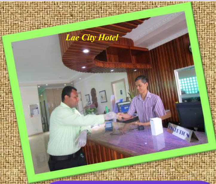
Lae City Hotel