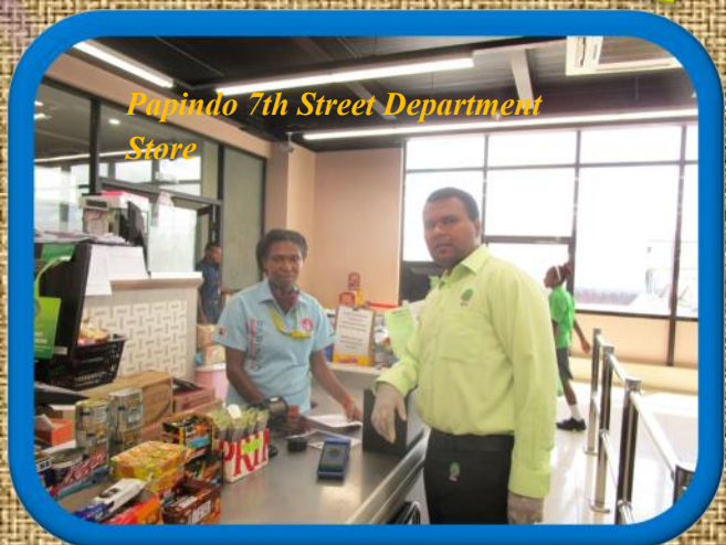
Papindo 7th Street Department Store

Need funds? Use mobile banking for instant service