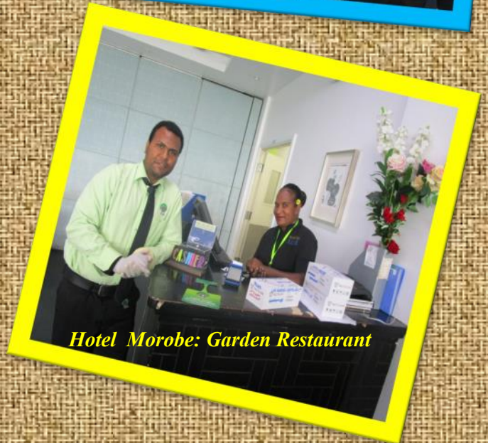
Hotel Morobe: Garden Restaurant