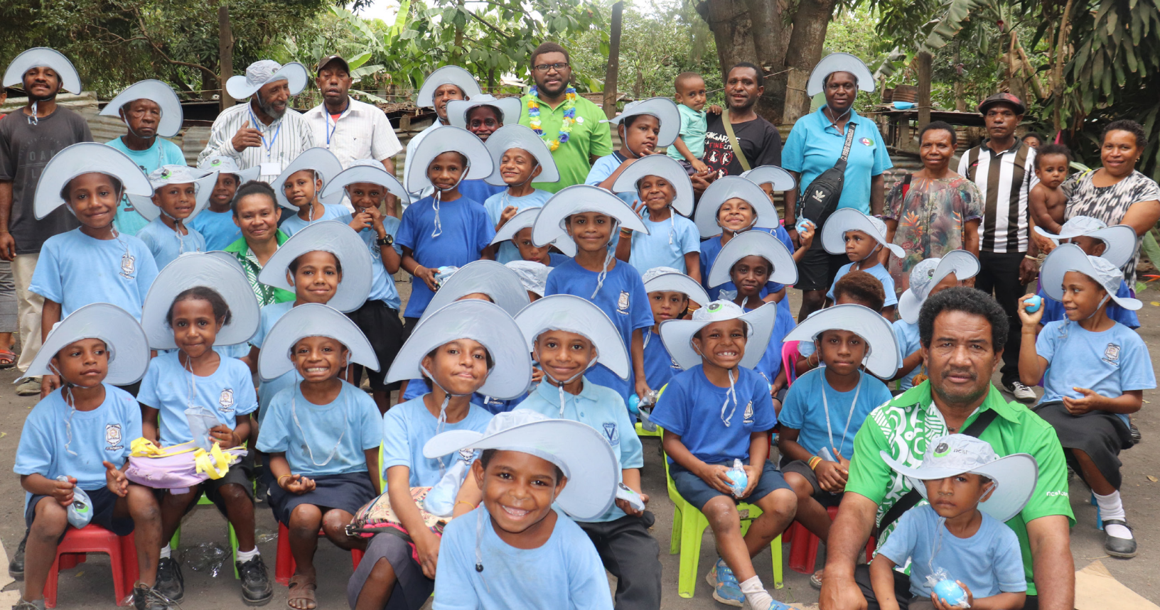
New Literacy College students surrounded by Parents, Teachers and ncsI staff.