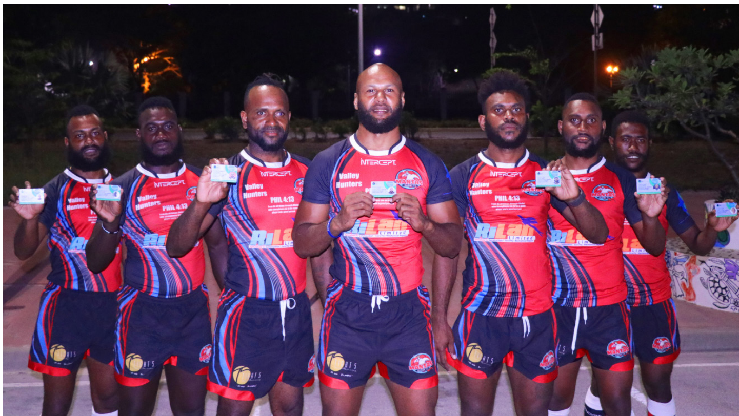
Mantas players display their ncsL ID cards after joining the Society.